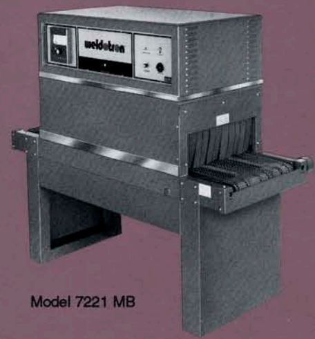
Model 7221 MB