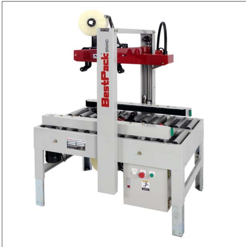
RS22 Random Side Drive